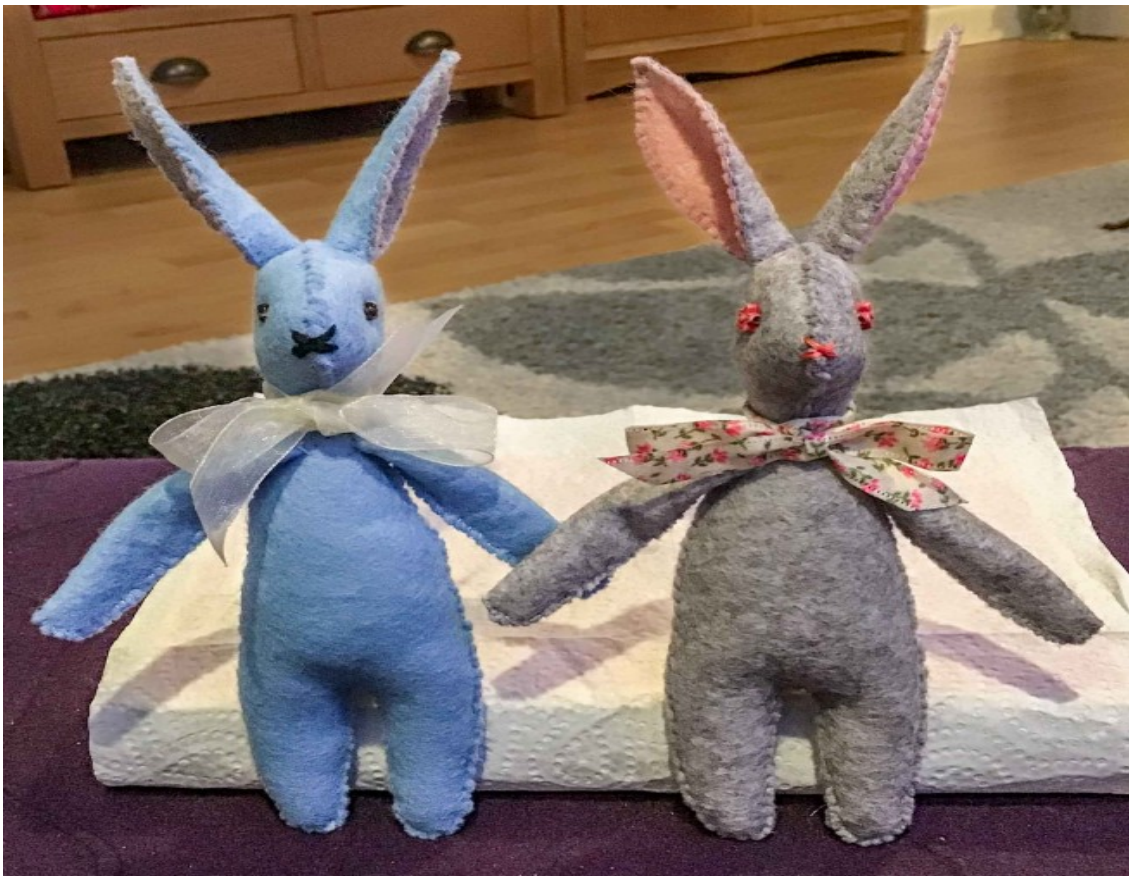
Two small felt Luna Lapin rabbits.