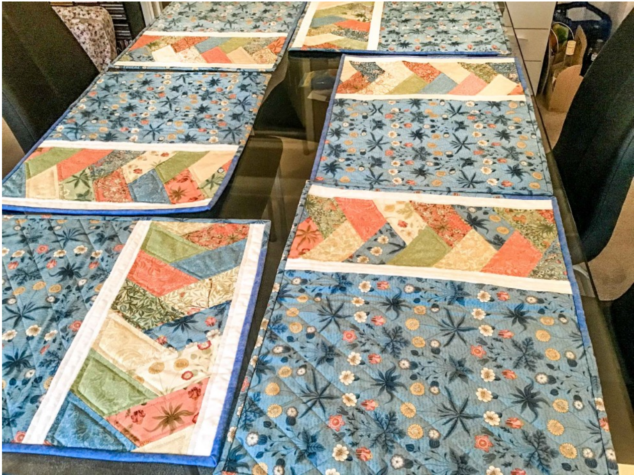
Six table mats from a pattern that was on Missouri star last November.