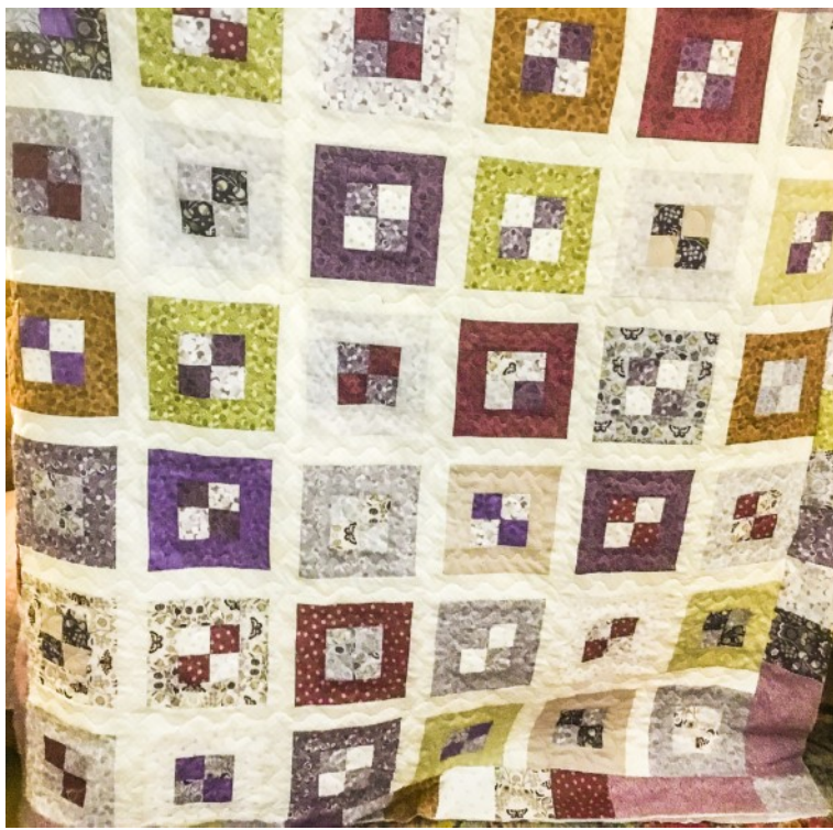
Three of the quilts I made during lockdown.