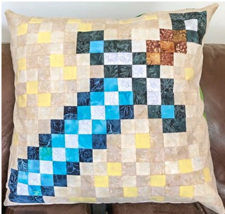
A Minecraft cushion for a friends grandson.