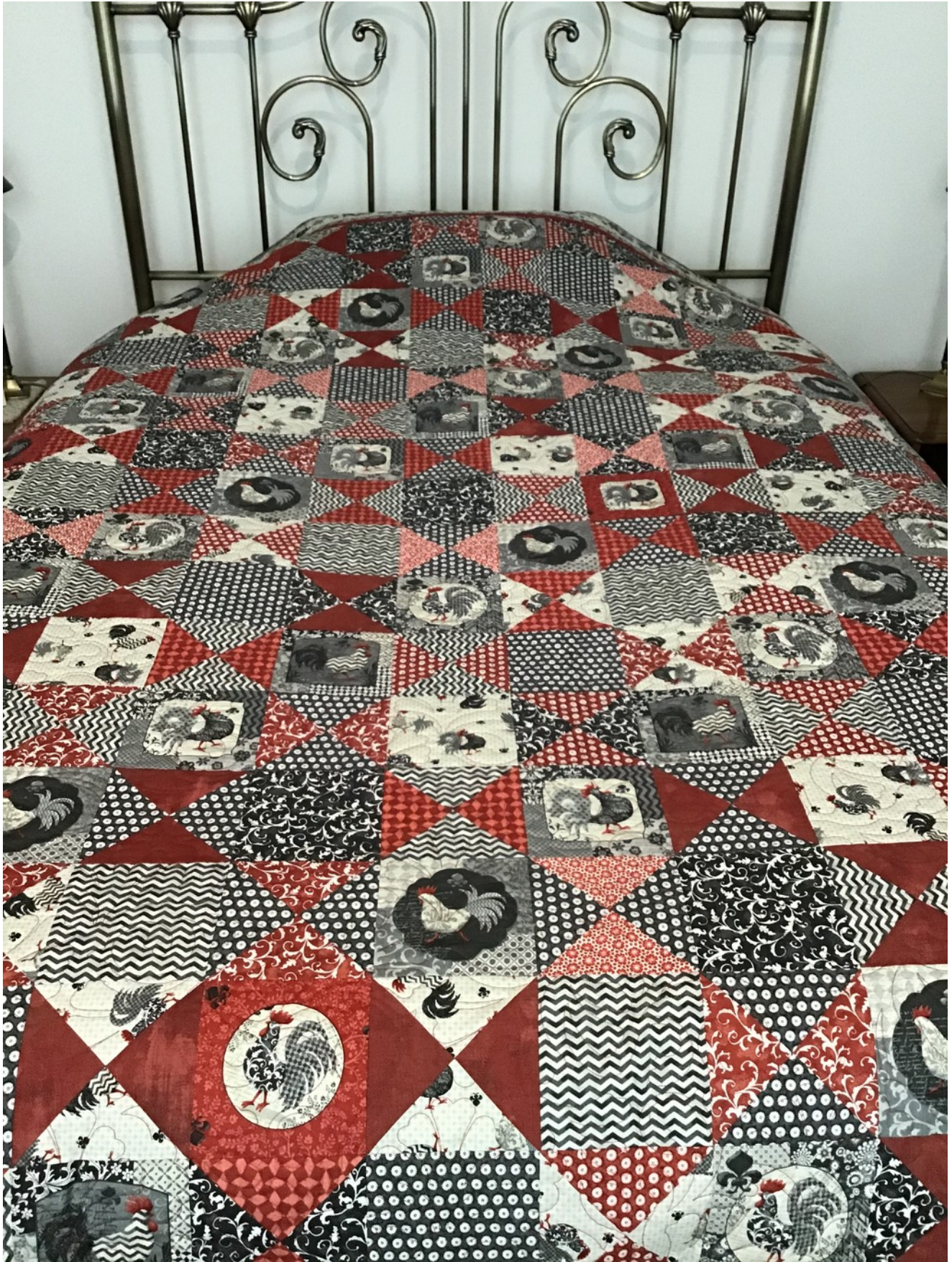
Photo of Poulet de Provence.